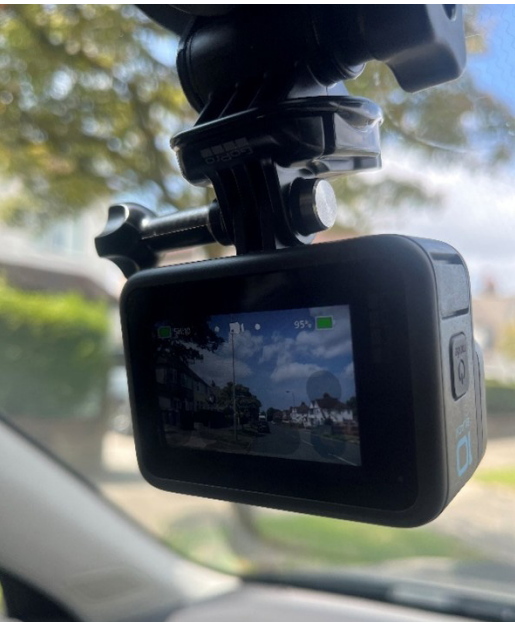
Figure 1: Camera setup for Infracare trial

The platform automatically identifies surface defects, calculates road condition indices, and recommends tailored technical treatments ranging from reinforcement to maintenance, localised repair or monitoring.