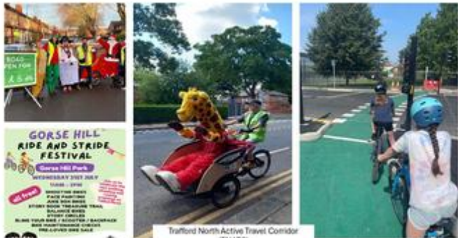
Trafford North Active Travel Corridor (TNATC) Corridor Activations