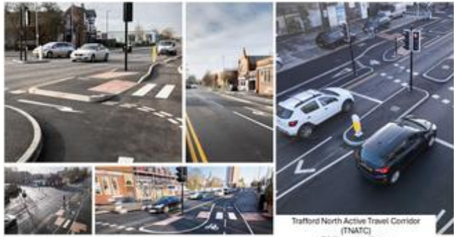
Trafford North Active Travel Corridor (TNATC) T6 Seymour Grove