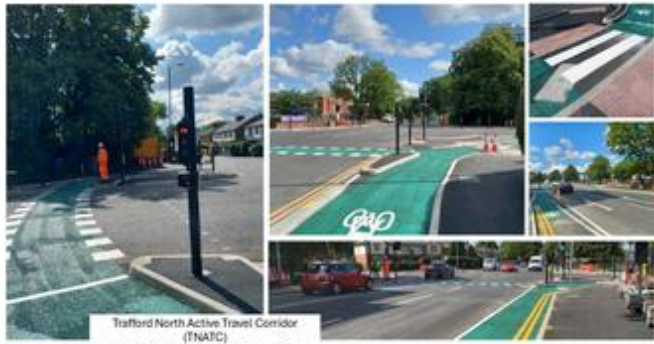
Trafford North Active Travel Corridor (TNATC) T1/2 Talbot Road CYCLOPS Junctions