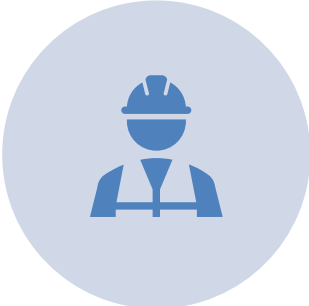
COMMISSION DORSET COUNCIL