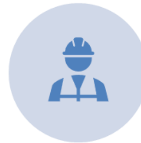
COMMISSION DORSET COUNCIL